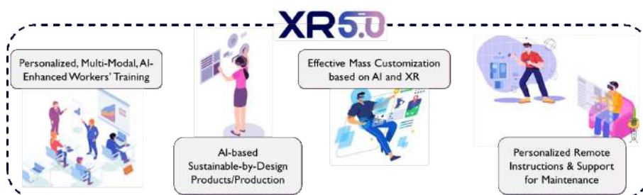
Fig. 2. XR5.0 Related Scenarios & User Journeys

3) Effective Mass Customization based on AI and XR : In this case, a product designer must use a Made-to-Order strategy to develop a customized product for a particular client. The designer will be able to generate numerous design possibilities by using a GenAI model thanks to XR5.0. Real-